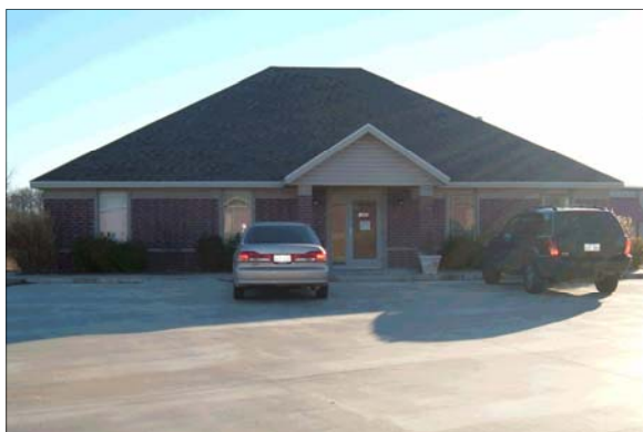
Pictured Above: The International Conference Headquarters, Fayetteville, AR.

It's convention time again and The International Conference of Funeral Service Examining Boards, Inc. is pleased to host the 101 st annual convention in beautiful Northwest Arkansas. The Ozark Mountains provide a backdrop for the University of Arkansas, home of the Arkansas Razorbacks. The quad-city area of Bentonville, Rogers, Springdale, and Fayetteville is home to the corporate headquarters of Wal-Mart, Tyson Foods, and J.B. Hunt Transport as well as ICFSEB's office. The Embassy Suites, headquarter hotel for the convention, is centrally located for easy access to many wonderful restaurants and shopping areas.