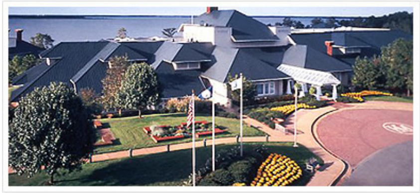
The Kingsmill Resort

The room rates for the Kingsmill are $129 for a deluxe guestroom and $139 for a river view guestroom. A tentative agenda with speaker information will be available soon on our web site. We hope to see you in Williamsburg!